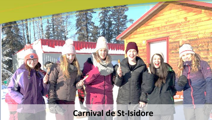
Carnival de St-Isidore