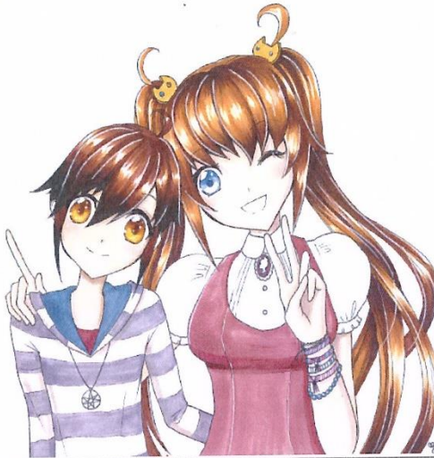
11. Alex and May - Character Sketch, 2015. Copic marker illustration.