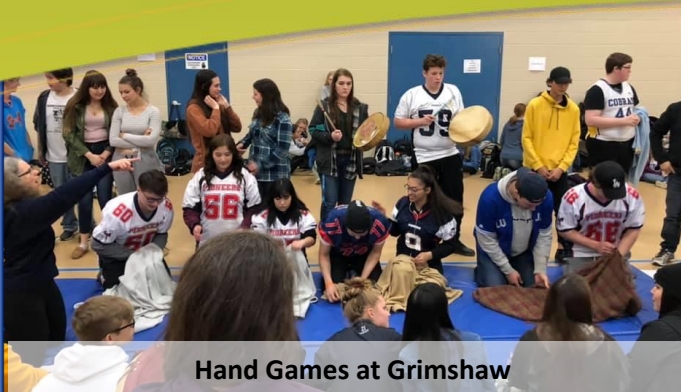
Hand Games at Grimshaw